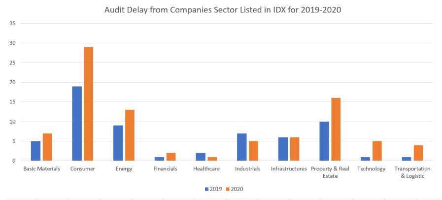
Figure 1 The number of cases of audit delay in companies listed on the IDX

The research will be conducted on primary and secondary consumer goods sector companies in 2019-2020. The development of this sector has high investor interest because its shares continue to offer upward potential. The consumer goods sector is companies that produce or distribute products and services sold to consumers, both primary and secondary goods. The primary consumer goods sector may include companies producing food, beverages, pharmaceuticals, agricultural products, cigarettes, and household goods. The secondary consumer goods sector includes companies that produce cars, household goods, clothing, shoes, and textile goods.